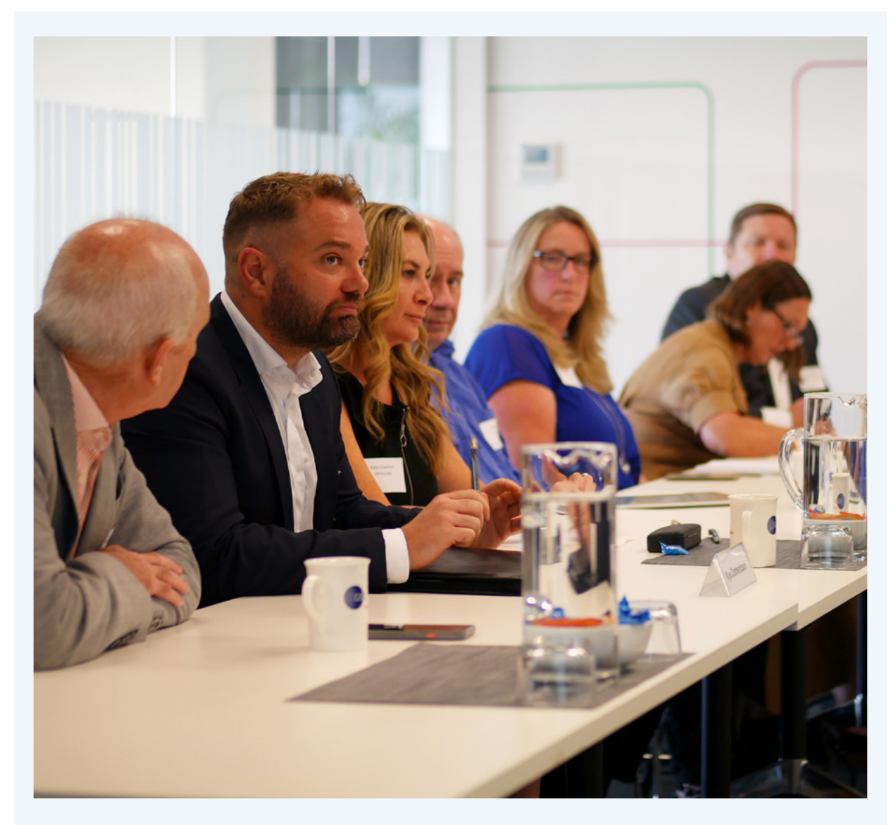
Some of the participants at the Melbourne Health SME Supplier Partnership Workshop held at GS1 in February, who were extremely pleased with the outcome of the pilot project.

MHL provided the catalyst for the pilot with its own capability-building initiative by implementing a new warehouse management system. This new system will transform their supply chain and inventory management through the implementation of data standards, automatic identification and data capture (AIDC), master data synchronisation and ultimately greater use of EDI.